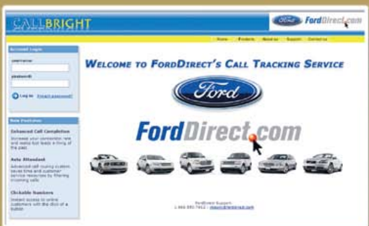
The Call Tracking Login Page: www.forddirect.com/calltracking

To listen to or view information about your Call Tracking calls and conduct administrative functions, go to www.forddirect.com/calltracking . If you don't remember your username or password, call the FordDirect Dealer Assistance Center at 866-550-7812.