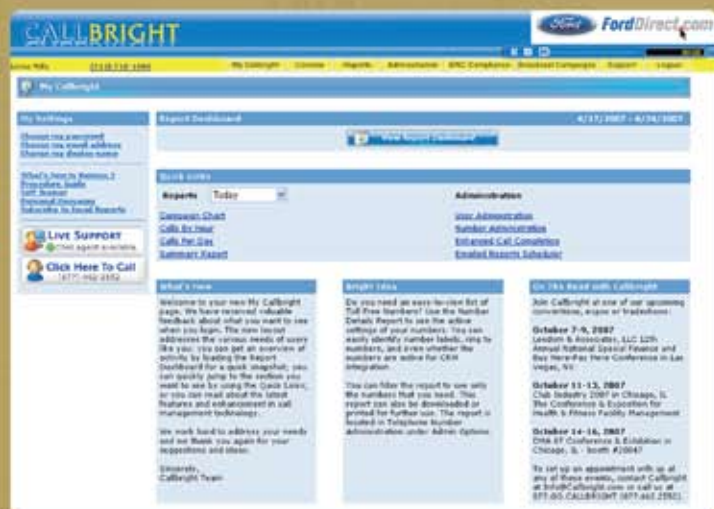
My Callbright Page

My Callbright is the primary page that you see after logging in.